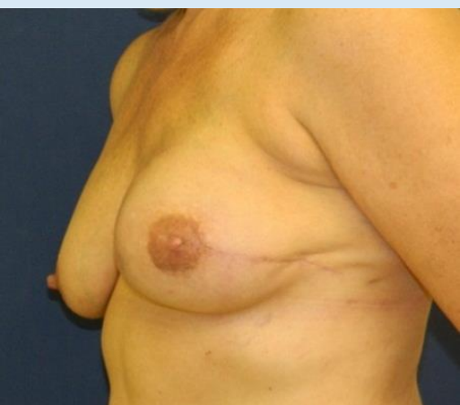
52 yo s/p staged reconstruction, HBOT initiated at 8 days, 20 treatments > reconstructive salvage