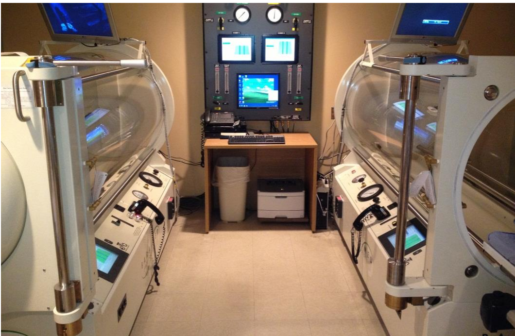
The Hyperbaric Unit at Good Samaritan Regional Medical Center